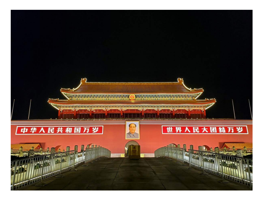
After the Tiananmen Square massacre in 1989, the Australian government issued 42 000 permanent residency visas to Chinese students studying in Australia.

Chinese community organisations can broadly be divided into two streams depending on the year of establishment: prior to 2000, and after 2000. During the 1980s and 1990s, newly arrived Chinese-Australians formed organisations to help with integration. This wave was largely in response to the final dismantling of Australia's discriminatory migration policies in the 1970s. Numbers were boosted by the issuing of permanent residency visas to 42 000 Chinese students studying in Australia in the aftermath of the Tiananmen Square massacre in 1989. These organisations were shaped by the nature of Australia's multicultural and welfare delivery policies.<sup>19</sup>