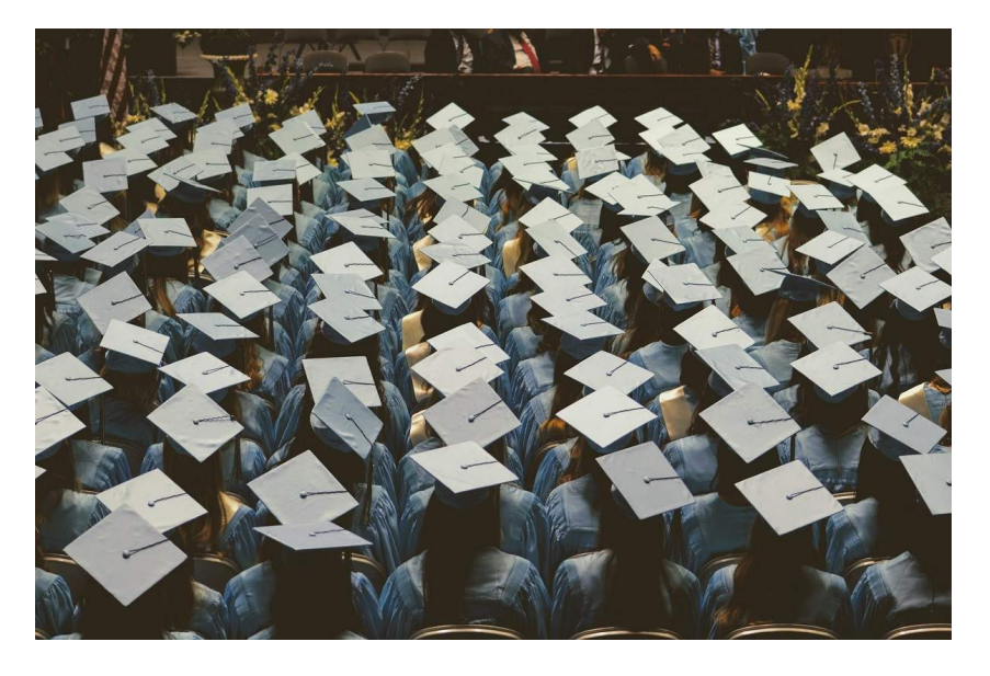
Some interviewees said they had joined Chinese student groups at university, only to leave when they found the organisations were being used for political purposes.

saw the existence of these laws as a logical tool for Australia's national security policy: "I think what the law has meant to do is to try to make a grey area with a bit of a hard line." <sup>75</sup>