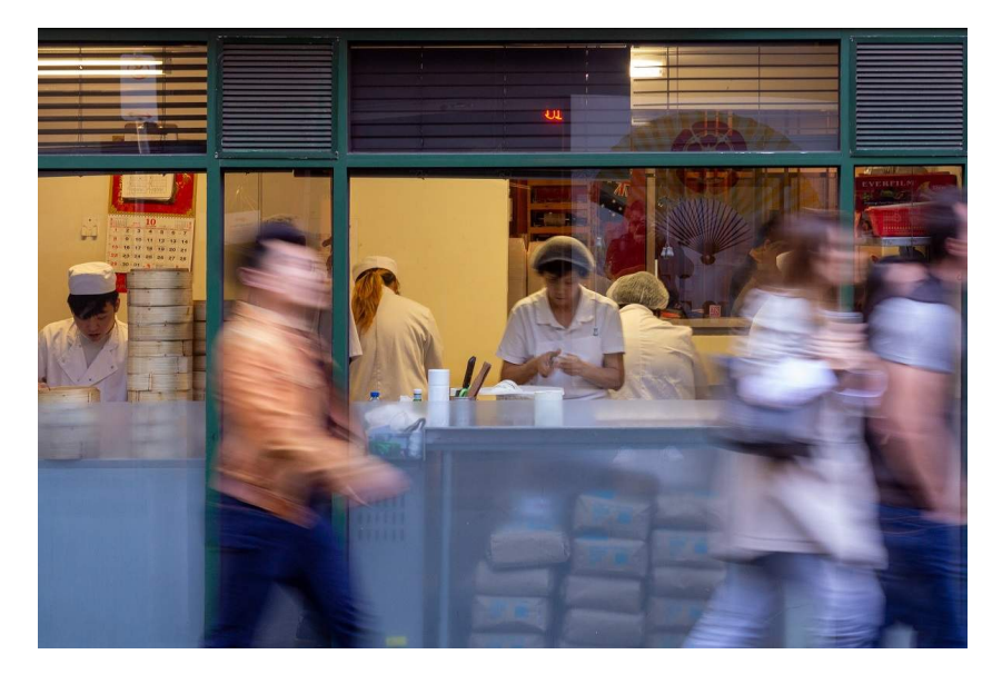
The Chinese-Australian migrant community fills a variety of professions, and runs businesses, big and small.

community organisations in Australia and the CCP's united front, a sprawling network of groups and individuals who aim to shape discourse and decision-making in Beijing's favour.<sup>12</sup> Rather than revisit the activities of the united front, this report seeks to better understand Chinese community organisations in Australia and the way they relate to the national debate about China. The Lowy Institute conducted a series of focus groups among Chinese-Australian communities and 30 in-depth interviews with Chinese-Australian community leaders between November 2020 and April 2021.<sup>13</sup>