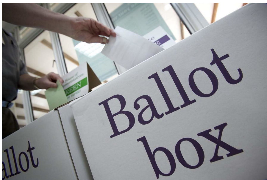
Australia's preferential and compulsory voting system is complex, especially for immigrants from non-English speaking backgrounds