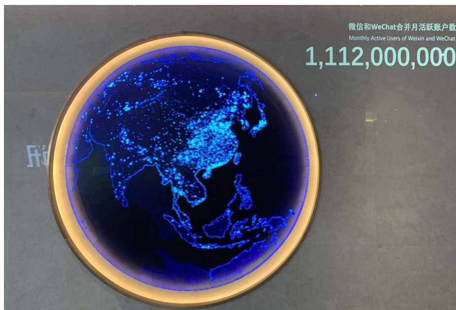
WeChat currently estimates its monthly users at 1.2 billion. User numbers are displayed on a foyer wall in Guangdong, China, in 2019

The most “Beijing-sensitive” discussion topics during the 2021 NSW local elections related to foreign influence and interference and included mention of “Falun Gong” and “Hong Kong demonstrations”. Two posts in one of the sampled group chats, shared by two separate group members, contained content that alleged Chinese foreign interference in a local council. Both posts brought up “Beijing-sensitive” keywords, including “Falun Gong” and “foreign interference”. One post contained a link to an article published by Vision China Times , titled “Red Shadow’ in Ryde Campaign”. 42 The second shared a YouTube video published by Vision China Times , accompanied by the poster’s own summary of the video’s key points. 43 Neither post was censored by the platform and reached at least 280 group chat members, although they solicited no follow-up group discussions. The individual accounts posting the content were not subsequently banned from the platform either. The fact that content and accounts usually considered “anti-CCP” were not censored by WeChat could be related to the lighter form of censorship evident on its overseas platforms.