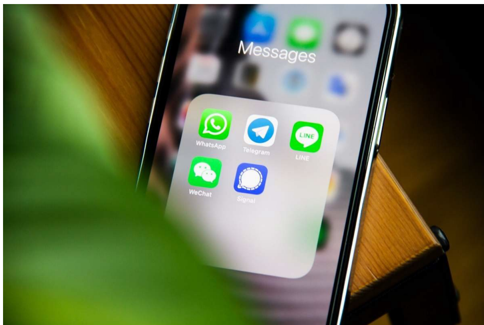
WeChat, the world's most popular Chinese-language social media app, emerged as a key political battleground in the last two Australian federal elections